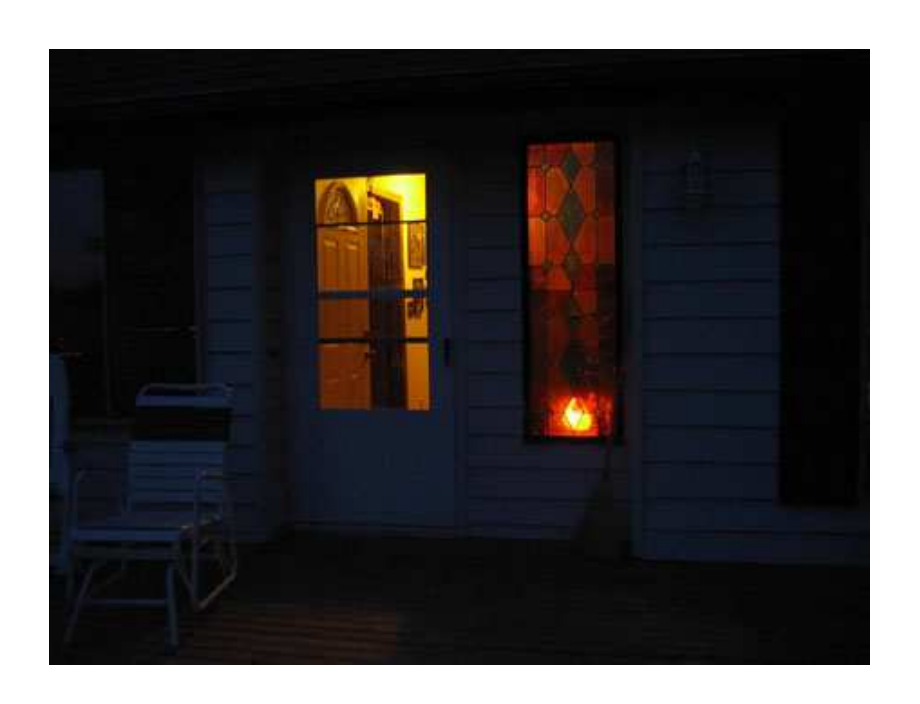
Don't Go There With Me - Ever Again

Gathering up our private and public property Killing the flower & spirit of the land Locking up our gifts of minerals, timber, recreation, animal & fowl For urban pleasure and power Pinning & framing what is beautiful & free to a wall Killing the flowers of free choice for all