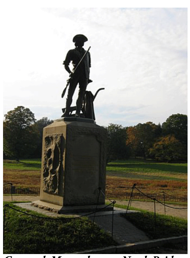
Concord, Massachusetts North Bridge where the rural farmers out gunned the British regulars and sent them running.