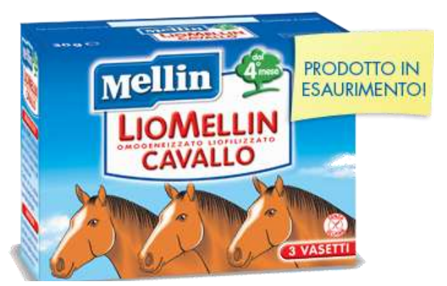
In Italy horse meat baby food is very popular with finicky mothers who want only the best and purest foods for their children.

Horsemeat is Nutritious. On nutritional websites horse meat is often lumped together with game meats as a lean, nutritionally dense source of protein. (14) An old USDA publication promoting both horse and goat meat from 1997 lists the nutritional characteristics of horse meat as low in fat with a 100-gram (3 1/2 ounces) serving of cooked, roasted meat as 175 calories; 28 grams protein; 6 grams fat; 5 milligrams iron; 55 milligrams sodium; and 68 milligrams cholesterol. (15) A Korean study that compared the nutritional characteristics of horse meat to pork and beef concluded that in comparison to both other meats, horse was particularly high in fatty acids and some vitamins. "Horse fat had a much higher α-linolenic acid than the others, probably due to the more intakes of fatty acids through hay by horses. Grasses usually contain significant amounts of α-linolenic acid. Although cattle gain the same amount of α-linolenic acid through hay, unsaturated fatty acids will be hydrogenated in the rumen and as a result very little α-linolenic acid will reach the animal's fat storage." (4)