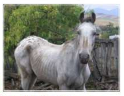
What if HSUS/PETA, spent as much money on veterinarians, and care givers as they do on slick city lawyers, six figure salaries, and million dollar ad campaigns?