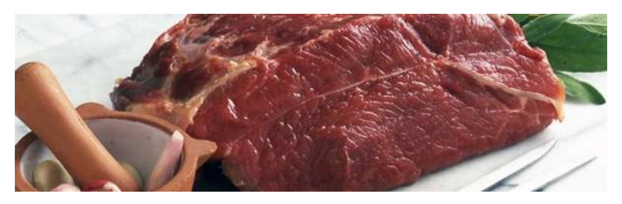
Find a recipe for Filet Mignon of Cheval at <a href="http://chevaline.us/Recipes">http://chevaline.us/Recipes</a>.

Let fully informed consumers decide for themselves whether they would like to have another culinary choice, or not. Let horse owners decide if and when and under what circumstances they want to market their horses. Let our ancient and venerable horse industry thrive. And protect our American freedoms and responsibilities.