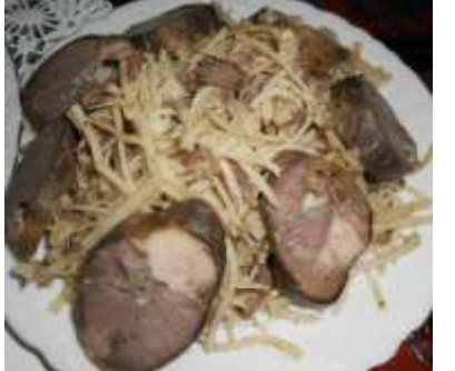
Uzbecki Naryn, horse meat dried with cumin, Aladdin Restaurant, NYC.

There is at least one restaurant in the U.S. serving horse meat in New York City. A food blog, the <u>United Nations of Food</u> (20), raved about an Uzbeki dried horse meat with cumin dish served at a new Armenian restaurant in Sheepshead Bay. "Even more awesome: one of our salads was an appealing little number called naryn, made