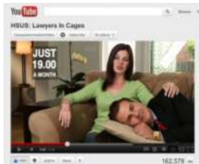
More needs to be done to expose the unethical practices engaged in by extremist groups like this clever video. (38)

The inevitable and immediate result is that horses suffer. Horses suffer tragically in huge numbers. People who depended on horses for their living, the families of breeders, trainers, veterinarians, farriers, stable owners, feed growers, equipment suppliers, all see their chosen and beloved profession become impossible to maintain, and the industry liquidates. Without a residual market for horses, the entire market collapses.