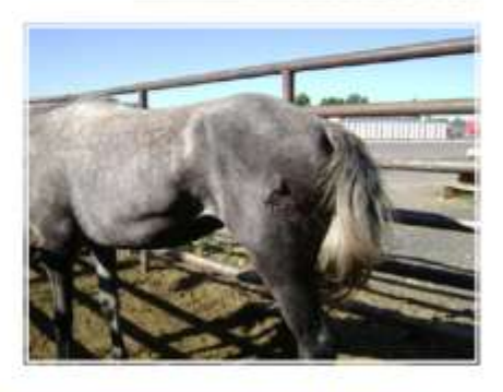
A young mare found with her brand cut out-turned loose on the Nevada desert to fend for herself.

Additional documentation of nation-wide abandonment and starvation of equines at http://www.abandonedhorses.net.