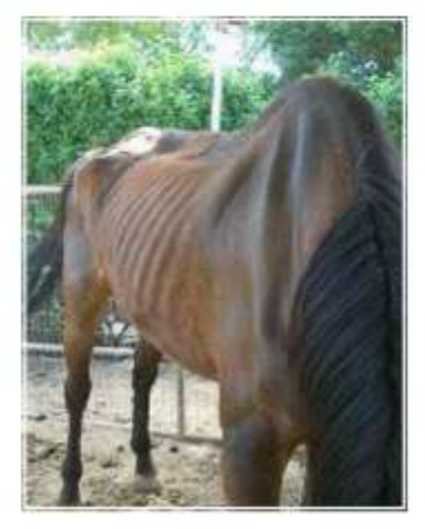
What if the people who couldn't take care of these horses, could sell them before they starved?

Horse owners and concerned citizens have come together with real solutions to ensure the humane care, management, and euthanasia of horses; to ensure the long-term sustainability and viability of the equine industry; and to restore the market for all horses. Anti-slaughter legislation exacerbates these problems, and offers zero solutions